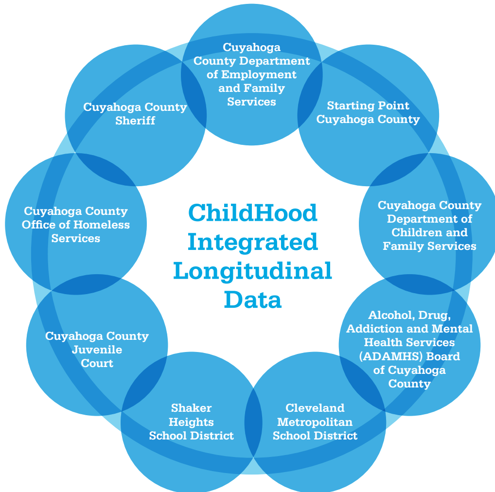
FIGURE 1. Contributing Agencies, Case Western Reserve University's ChildHood Integrated Longitudinal Data.